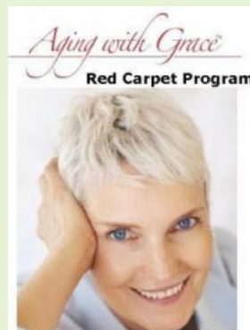
Click image to view brochure

Aging with Grace has proudly partnered with Holiday Retirement to offer our members exclusive added discounts through The Red Carpet Program.